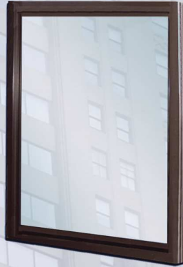
CTP - 2100 AAMA F-HC50 IGCC-CBA