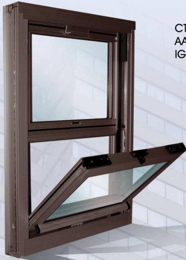
CTD - 2000A AAMA H-C60 / CW-PG50 IGCC-CBA