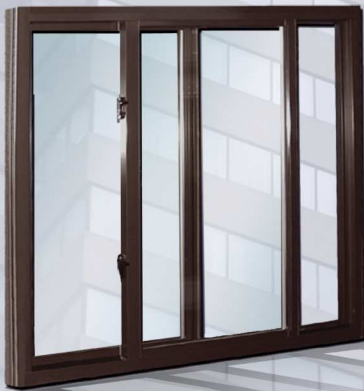
CTS - 2300 AAMA HS-C50 IGCC-CBA